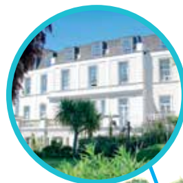
TLH Toorak Hotel