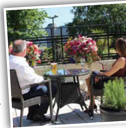
Alberts Bar Terrace

The perfect bowls viewing area, our Clubhouse Bar overlooks our 4 rink tournament standard indoor bowls arena.