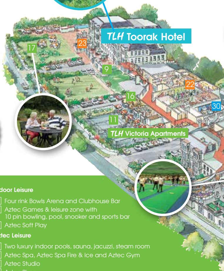
TLH Victoria Apartments